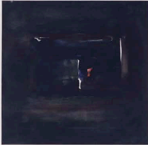
Top: Carola Clift, 7 April 2008 , watercolor, 10 x 10"; below: Bill Clift, La Mesita , photograph, 13 x 19"

While his parents were building their house in Las Campanas, young Will supplemented his wooden toy set with spare scraps of wood. For a high school physics assignment on equilibrium, he cobbled together three pieces of wood